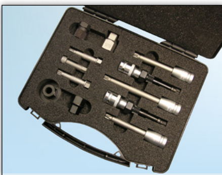
Image 3: INA special tool, part no. 400 0241 10

The two over-running alternator pulleys fully comply with the technical requirements and only differ in their appearance.