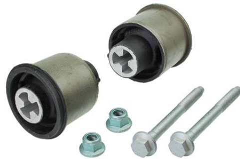
MEYLE no. 114 710 0001/S