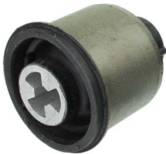
MEYLE no. 114 710 0001 [Ref. no. 6RD 501 541 A]*