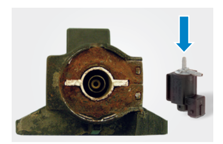
Corroded switchover valve (open)