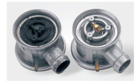
Open secondary air valve Left: Damage caused by exhaust gas condensate Right: New condition

Check the connection for leaks and re-seal if necessary.