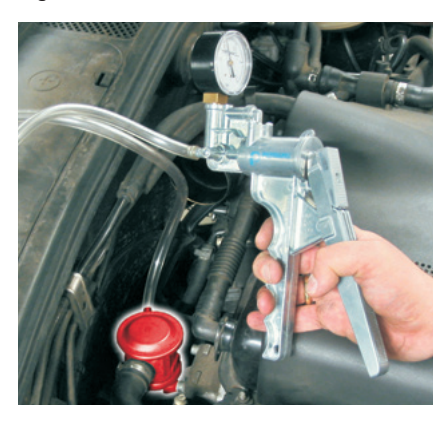
Checking a secondary air valve with a vacuum hand pump