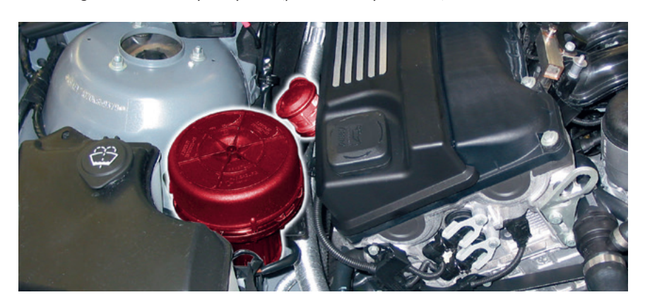
Secondary air valve and secondary air pump in BMW E46 (highlighted)

Block diagram of secondary air system (pneumatically actuated)